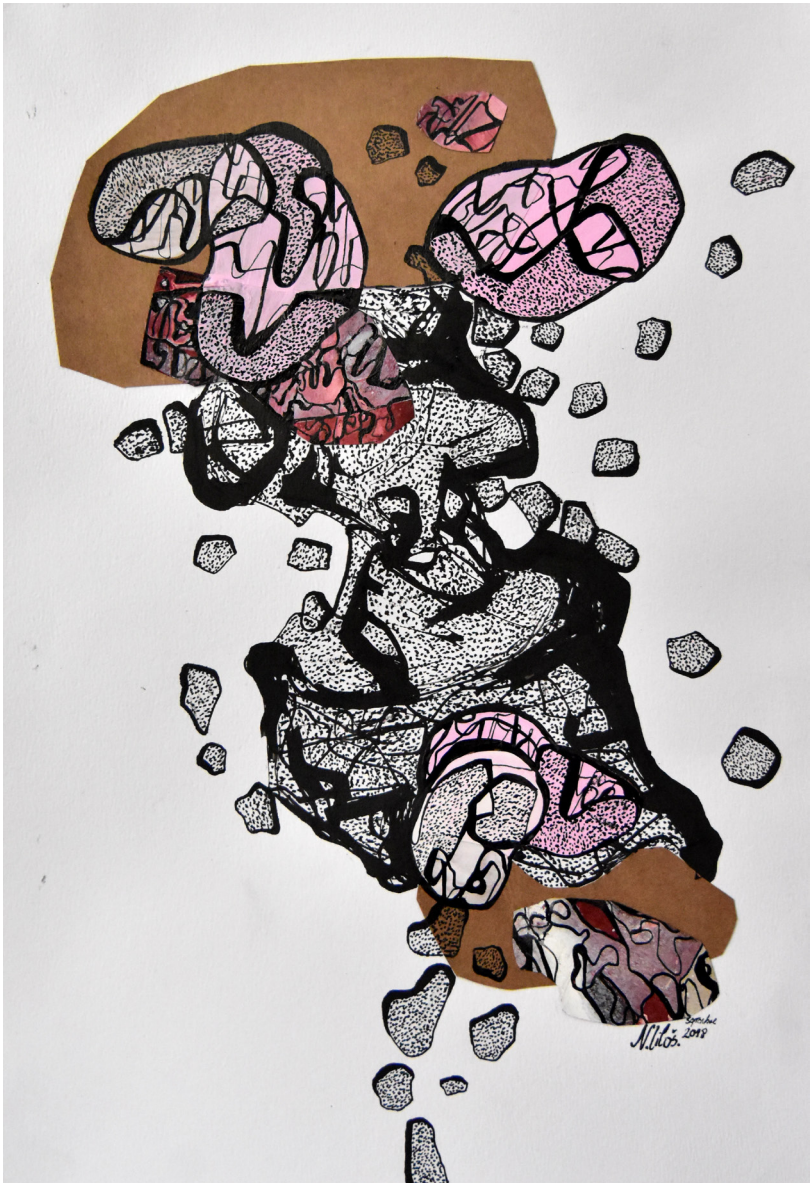
Efekat LimuNade / LemoNade Effect kolaž / kombinovana tehnika (papir, akrilik, tuš i pero na papiru) collage / mixed media (paper, acrylic, Indian ink and pen on paper) 35x25 cm, 2018