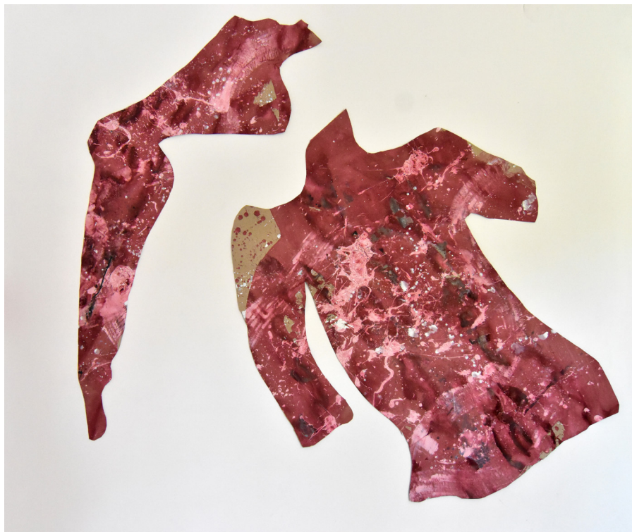
OVAJ KOJEM SMO BLIŽI / THE ONE WE ARE CLOSER TO Instalacija (detalj) Installation (detail) 2018