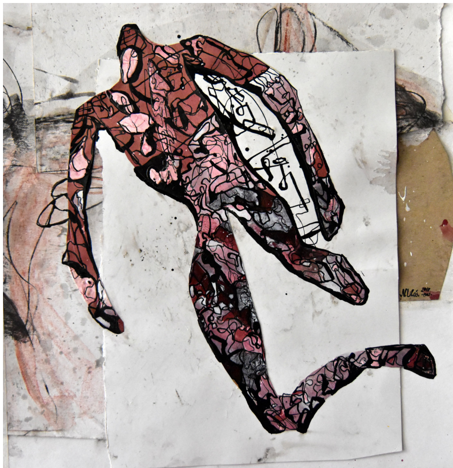
Buđenje / Awakening kolaž / kombinovana tehnika (papir, akrilik, tuš i pero na papiru) collage / mixed media (paper, acrylic, Indian ink and pen on paper) 40x40 cm, 2018